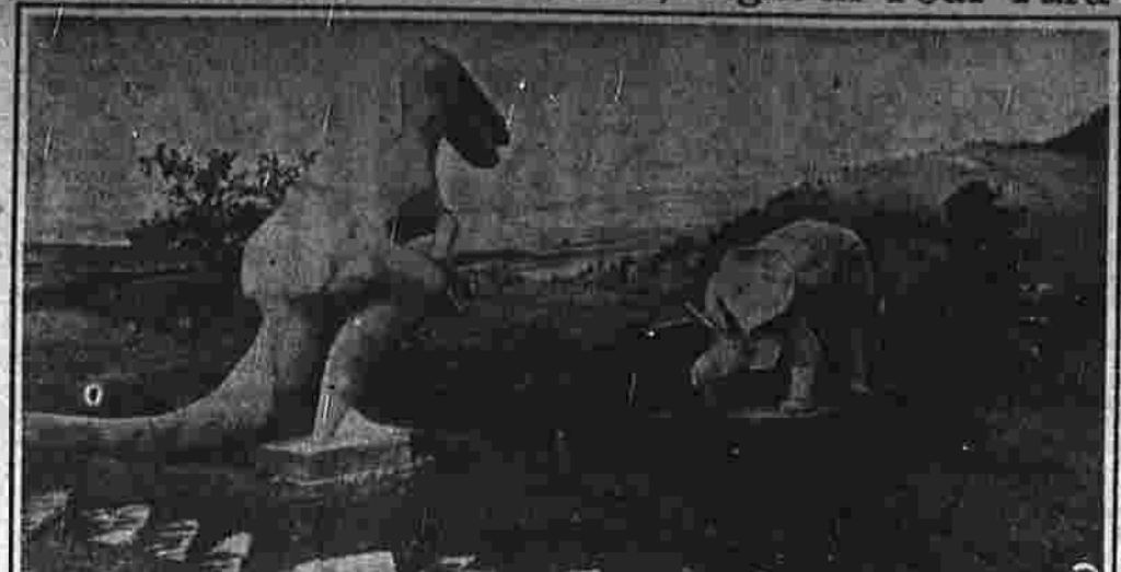
On the site where mighty dinosaurs once roamed for food and carried on predatory battle with each other and with, perhaps, an Allosaurus and his comrades...